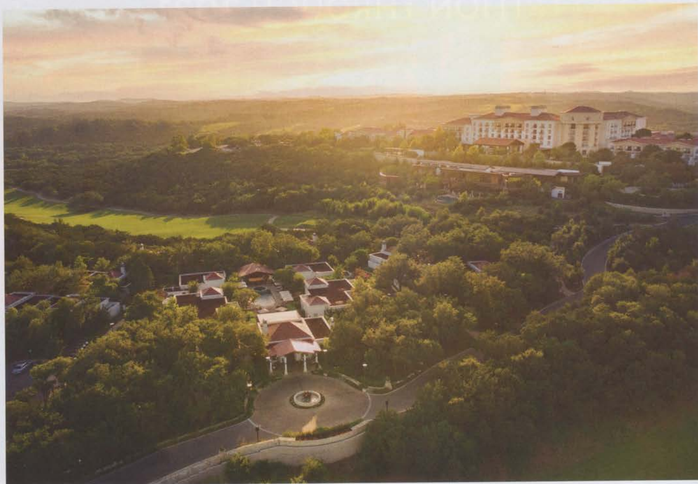
La Cantera Resort & Spa is home to Loma de Vida Spa & Wellness.

» THE LAST TWO YEARS have been, to put it mildly, challenging. Showing your team some appreciation for a job well done with a little spa pampering will allow them to relax and regroup together. Whether you're looking to make a day, weekend or week of it, Texas has a spa retreat to suit your needs.