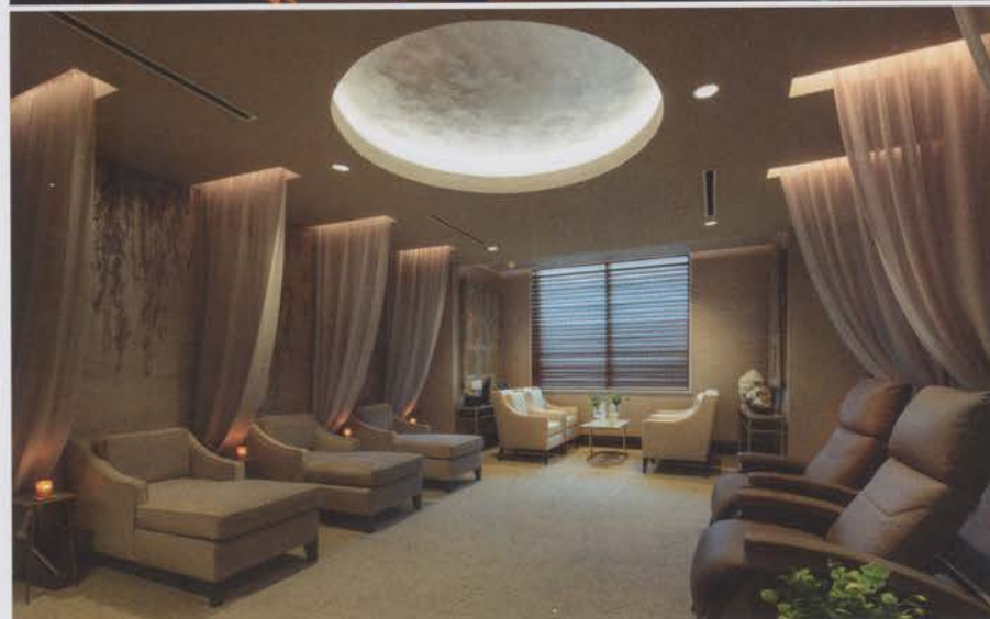
The infinity-edge pool at La Cantera (top); The Spa at The Post Oak Hotel